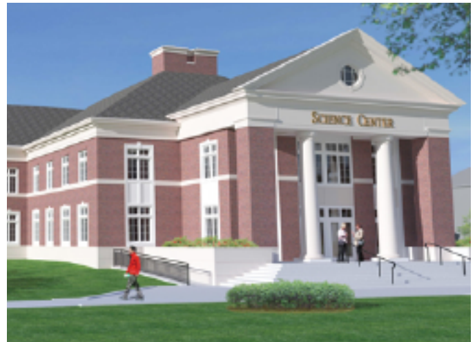
Young Hall (expected completion in 2010)

The building stands directly in front of the site of the first Young Hall, which had been built in 1909 and destroyed by fire only days before its scheduled demolition in 1970. A new two-story addition to the