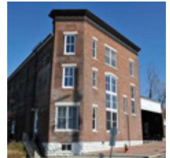
Combs Center Warehouse