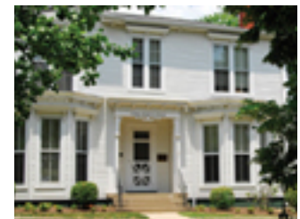
Ruby Cheek House