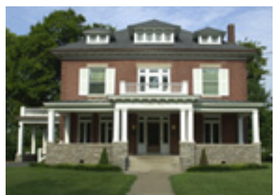
Chenault Alumni House