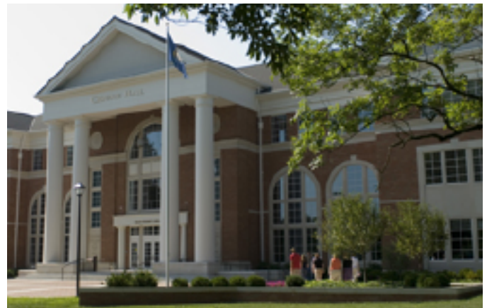
Crouse Hall, including Doherty Library