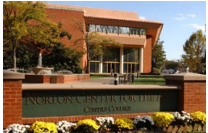
Norton Center for the Arts

toward its construction), Carnegie served that purpose until the construction of Doherty Library in 1967. It currently houses the Center for Global Citizenship and Career Services, as well as a special-occasion dining room. Carnegie is listed individually in the National Register of Historic Places.