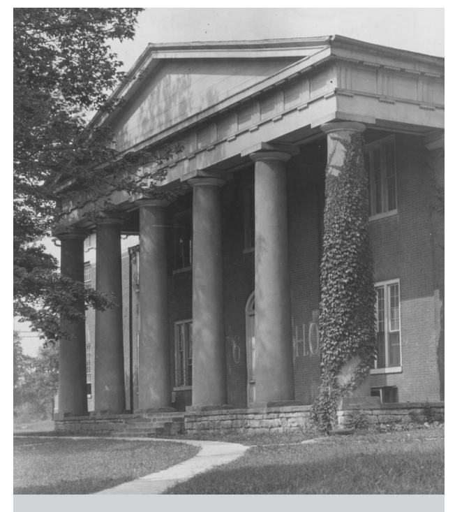
Centre College received its charter from the Kentucky Legislature on January 21, 1819. Classes began in the Fall of 1820 in the first building of the College, Old Centre, with a faculty of two and a student body of five.

Centre set another national record when it achieved a 75.4 percent participation rate for alumni contributing to the college's annual fund, a record that remains unbroken. Centre has led the nation in the percentage of alumni who make contributions to their college over the last 25 years.